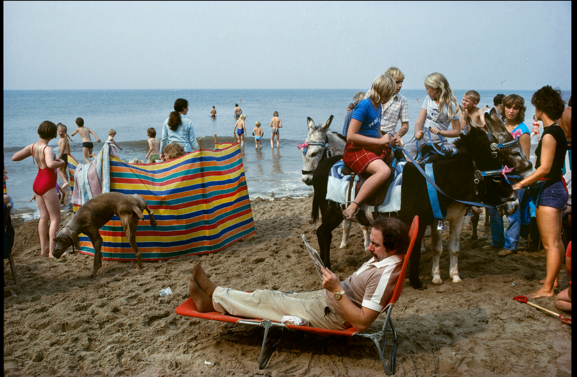
Chris Steele-Perkins Blackpool, England, 1982. Image © Chris Steele-Perkins/ Magnum Photos.