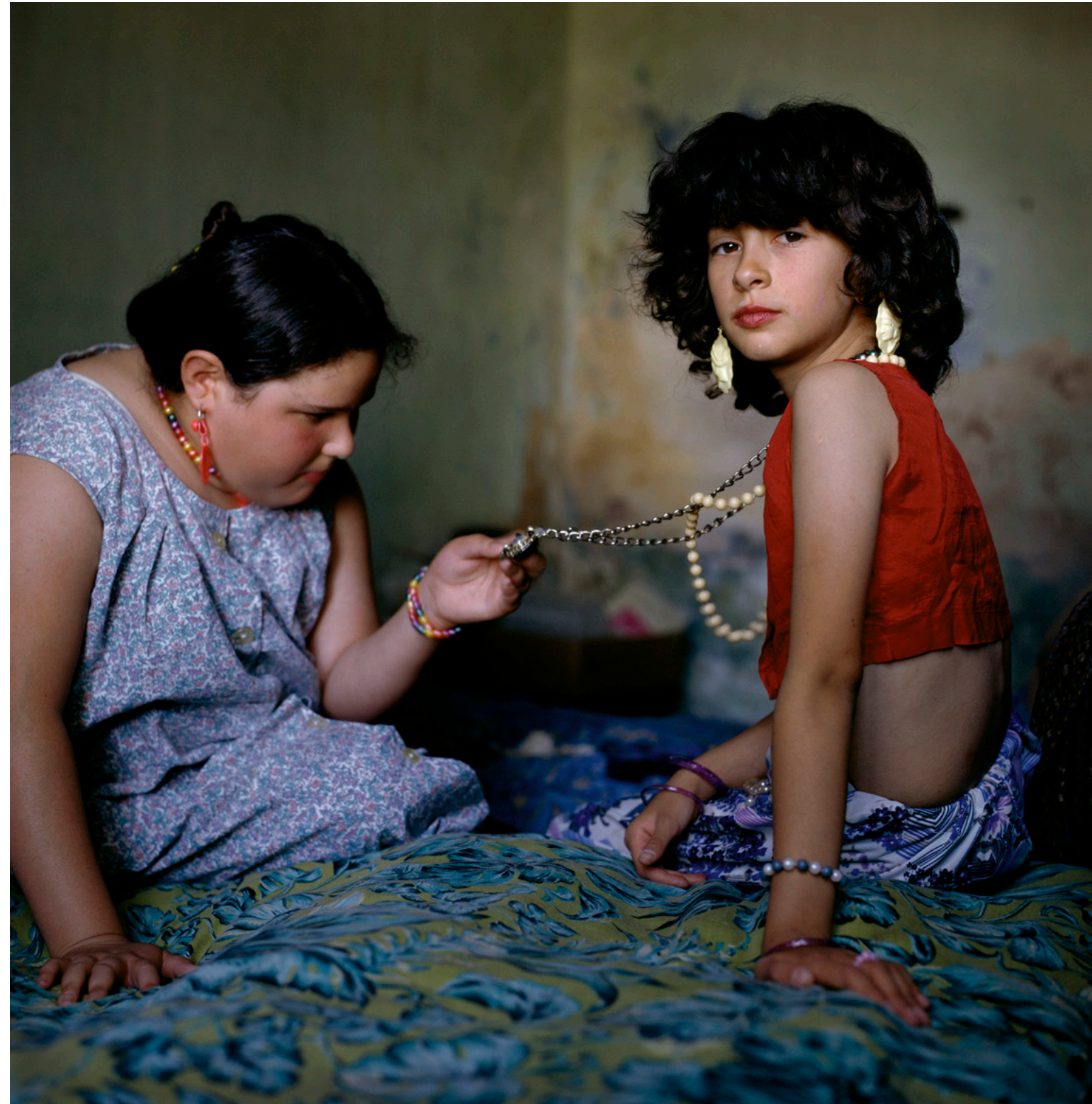
Alessandra Sanguinetti The Necklace. Buenos Aires. Argentina. 1999.