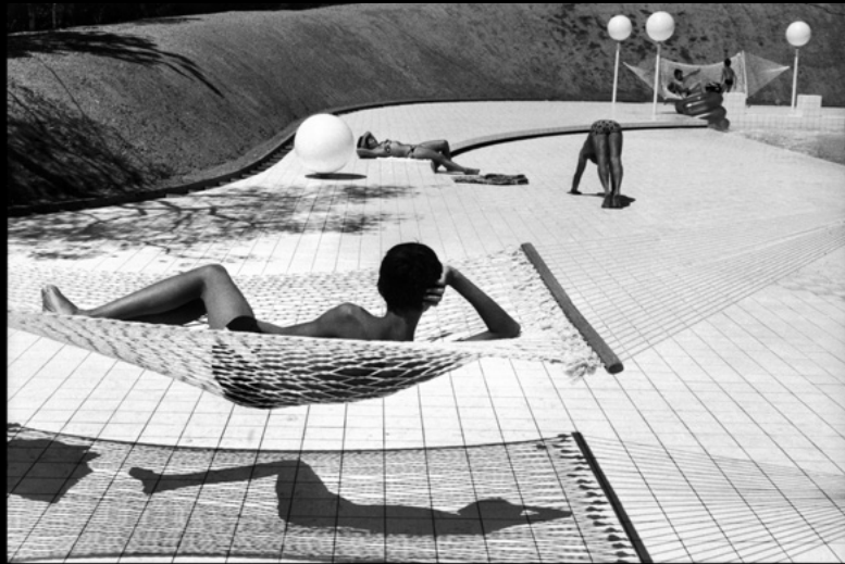
Martine Franck Pool designed by Alain Capeilleres. Town of Le Brusc. Provence. France. 1976. Image © Martine Franck/Magnum Photos.