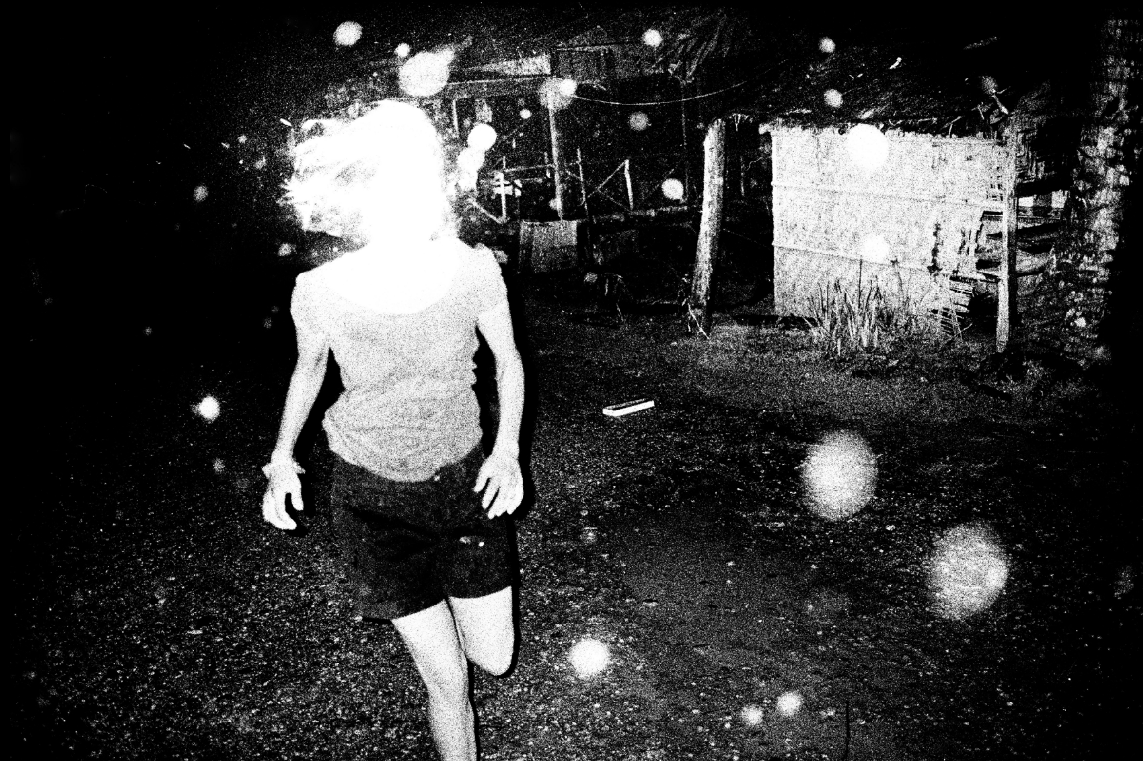
Sohrab Hura Stormy night. Laos. 2011.