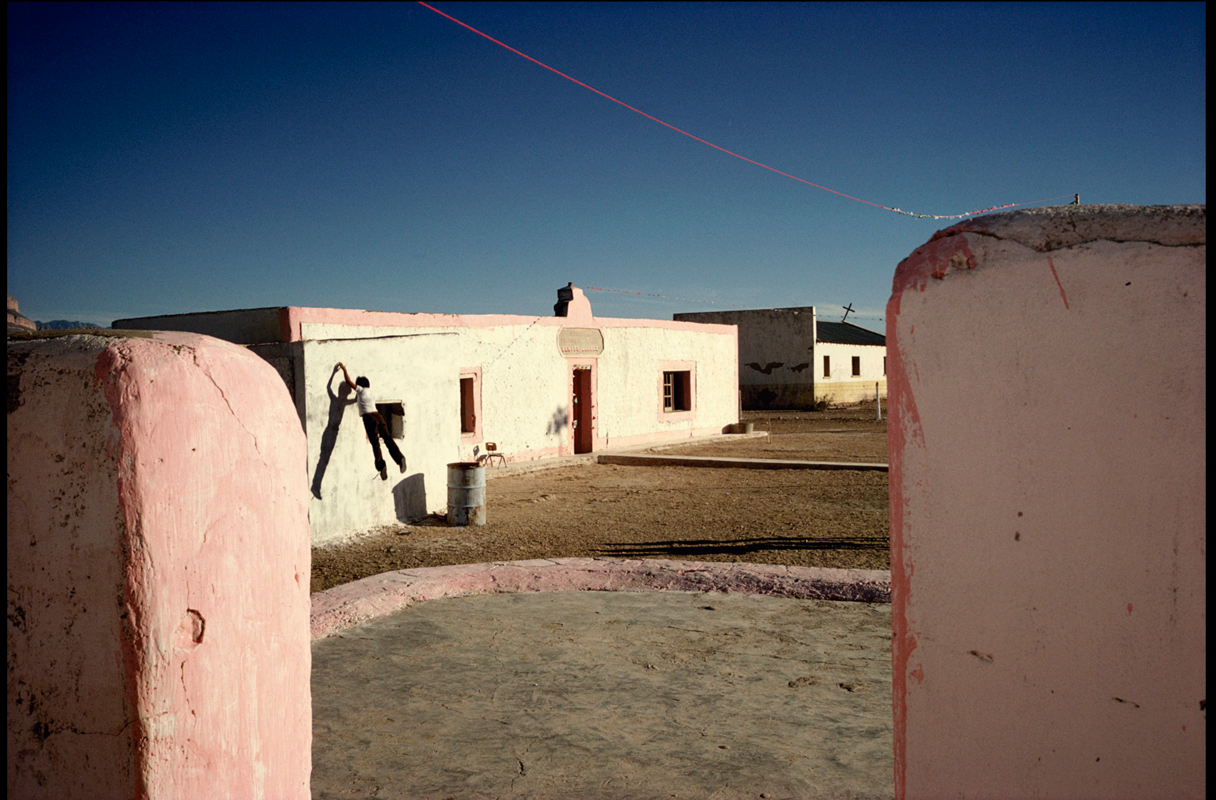
Alex Webb Jumping. Boquillas (Border). Mexico. 1979.