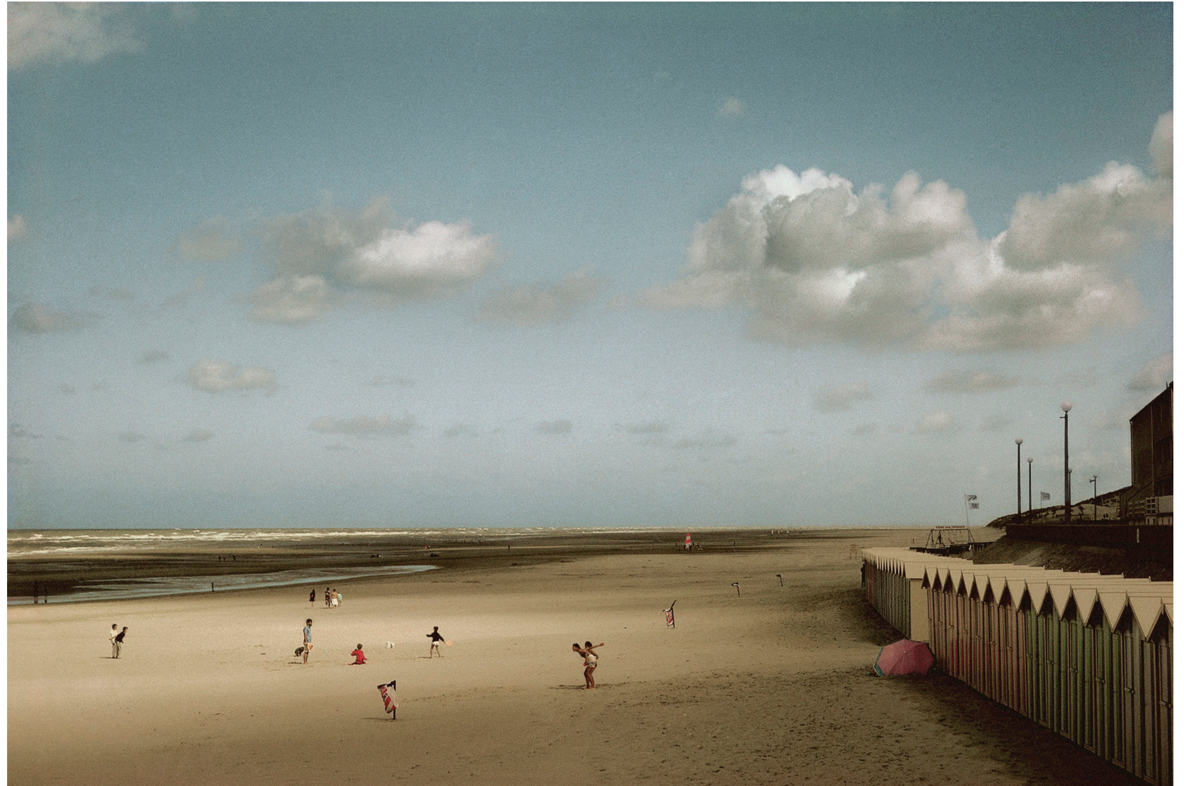
Bay of the Somme river. Somme departement. Fort Mahon. Picardie region. France. 1991.