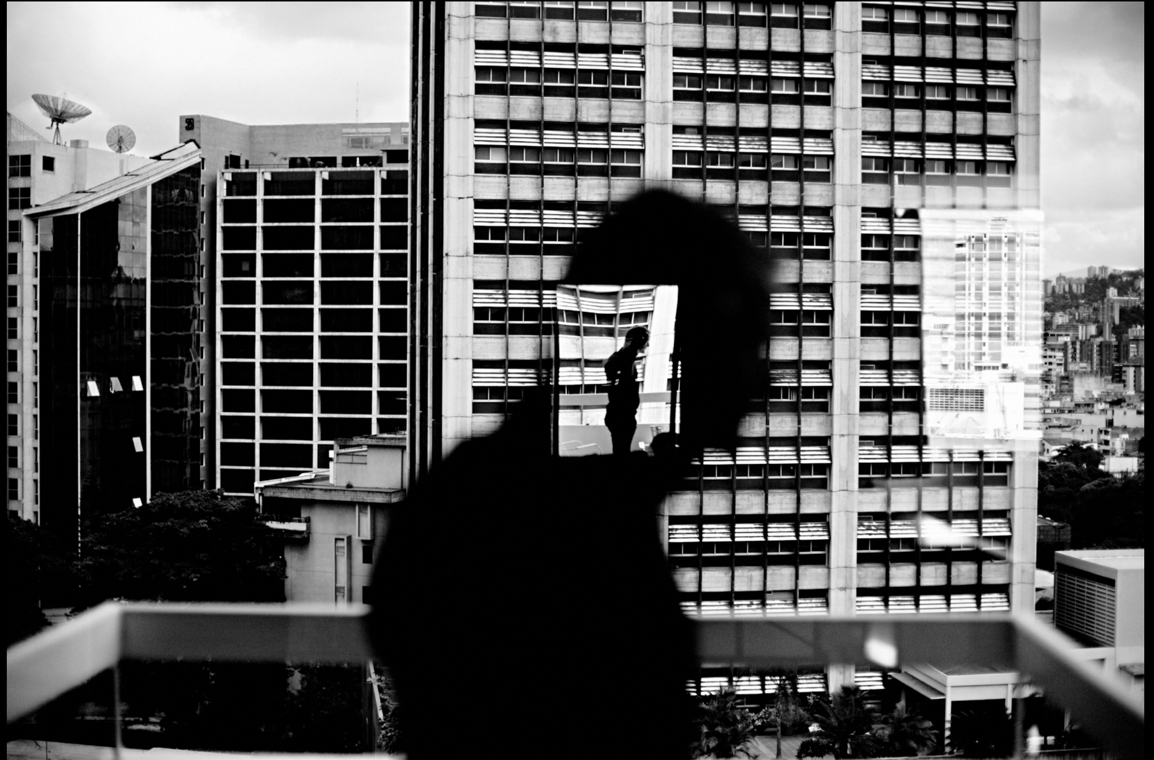
Christopher Anderson Reflection in window in Altamira. Caracas, Venezuela, 2006.