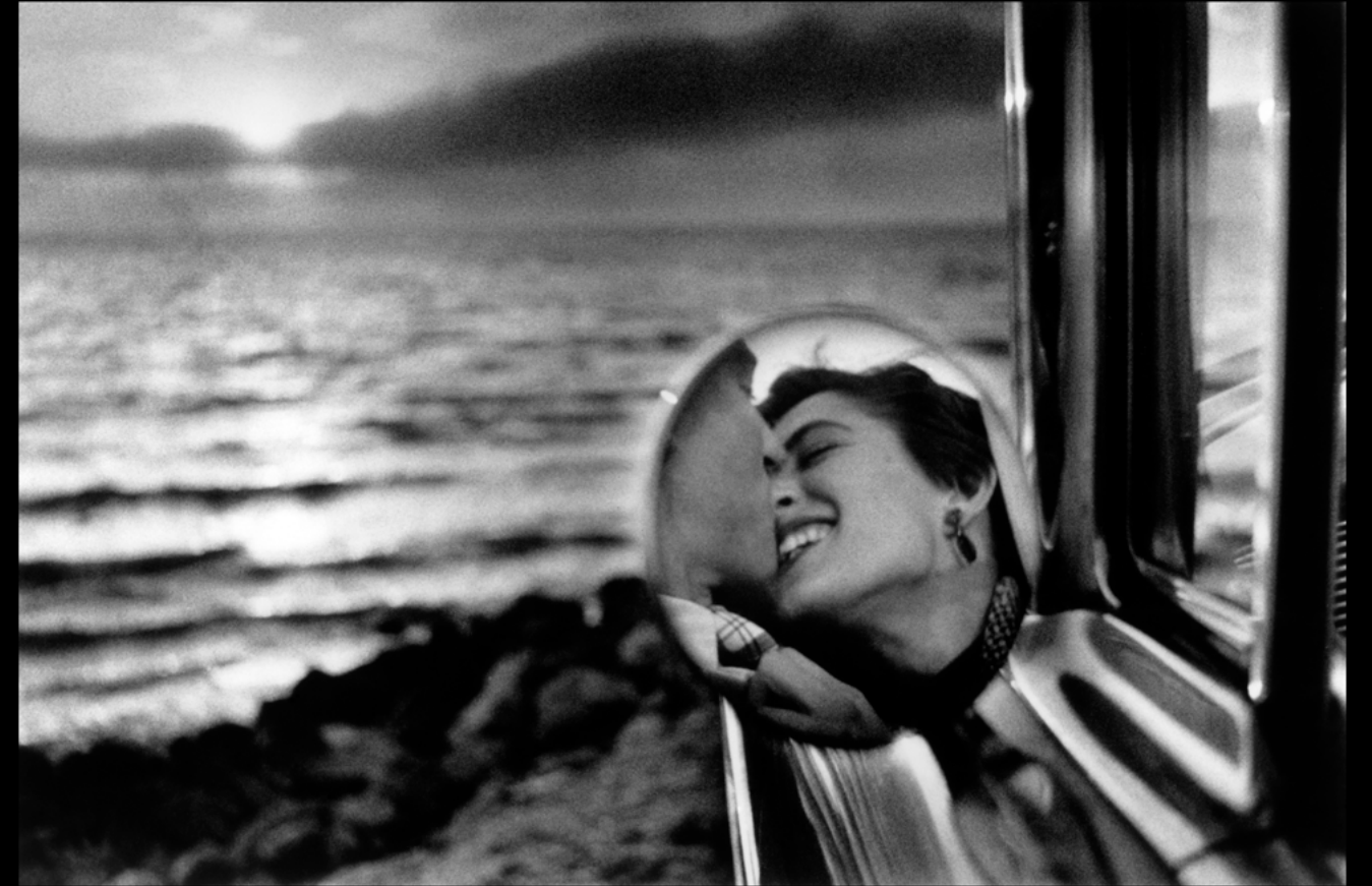
Elliott Erwitt California. USA. 1955.