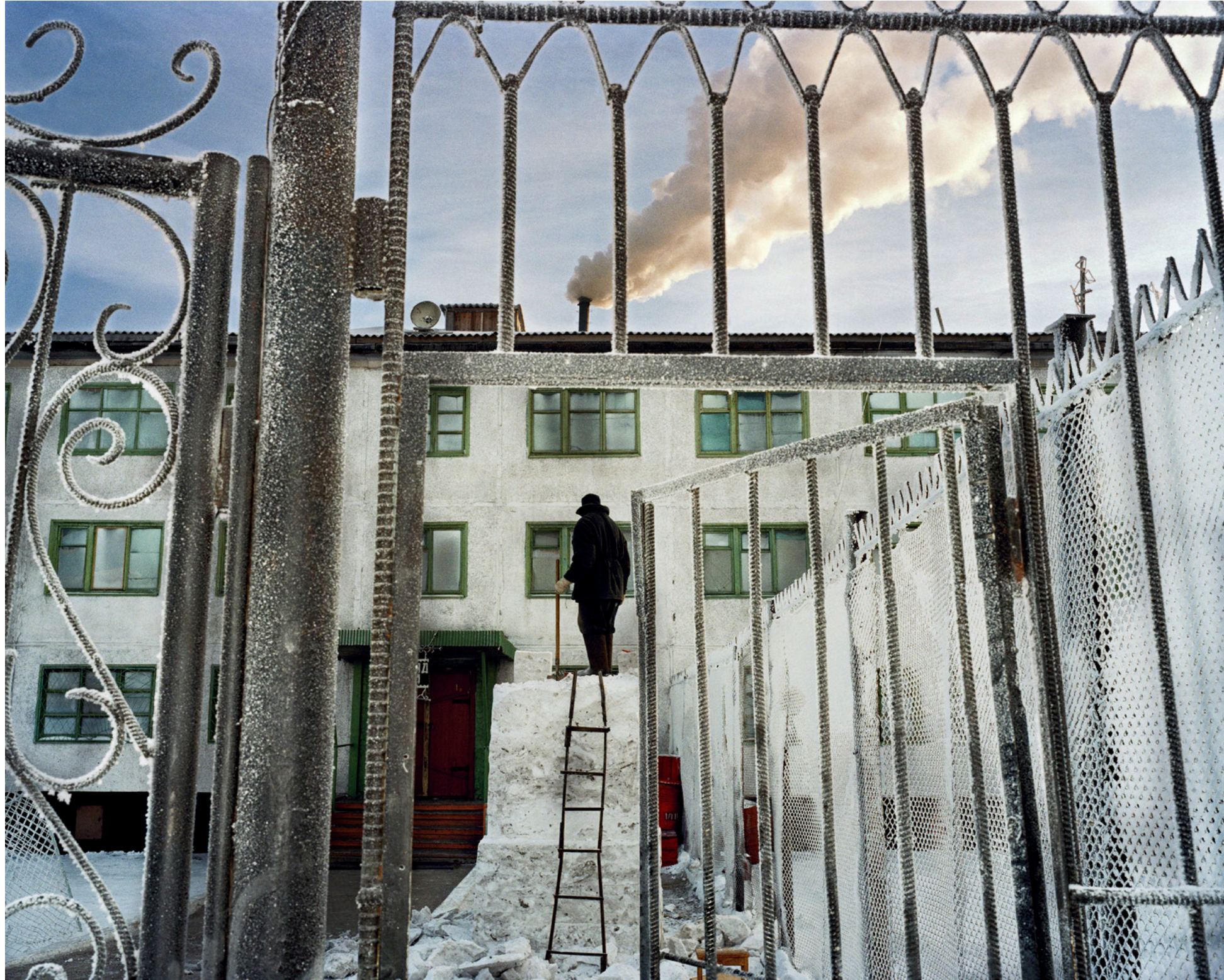
Carl De Keyzer

Ice sculpture for a competition at an ex gulag turned prison camp. Project "Zona". Novobirusinsk. Krasnoyarsk region. Siberia. Russia. 2002.