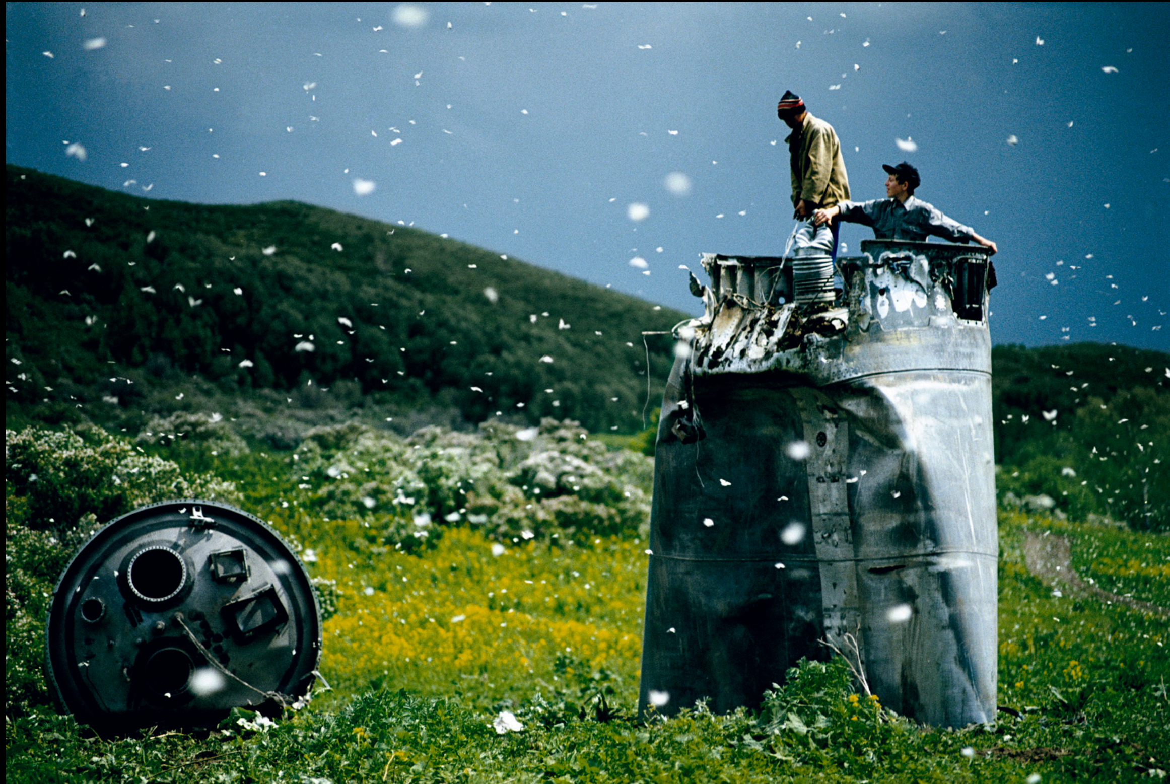
Jonas Bendiksen Villagers collecting scrap from a crashed spacecraft, surrounded by thousands of white butterflies. Environmentalists fear for the region's future due to the toxic rocket fuel. Altai Territory, Russia. 2000. Image © Jonas Bendiksen/Magnum Photos.