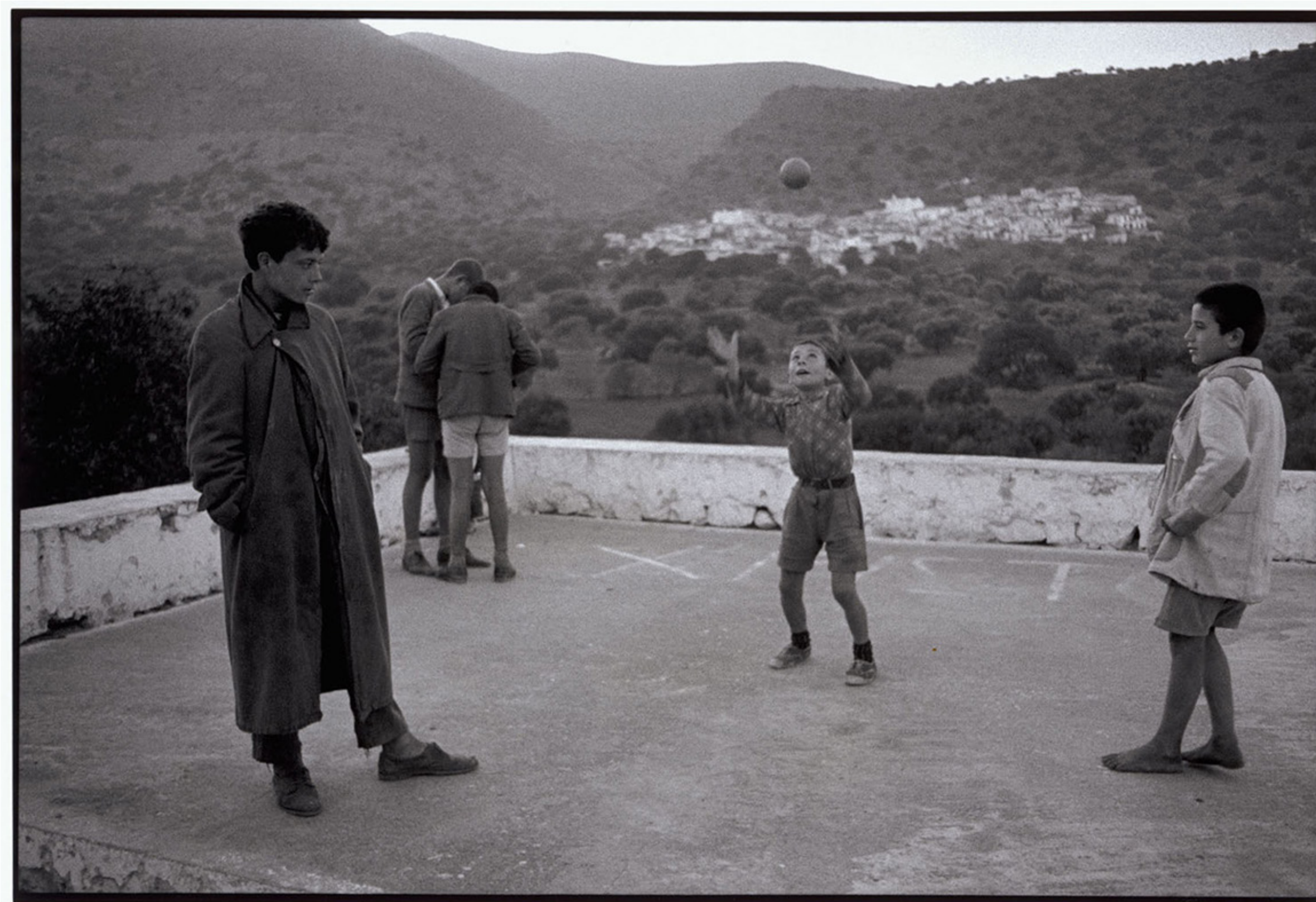
Constantine Manos Playing in the square. Elounta. Crete. Greece. 1964.