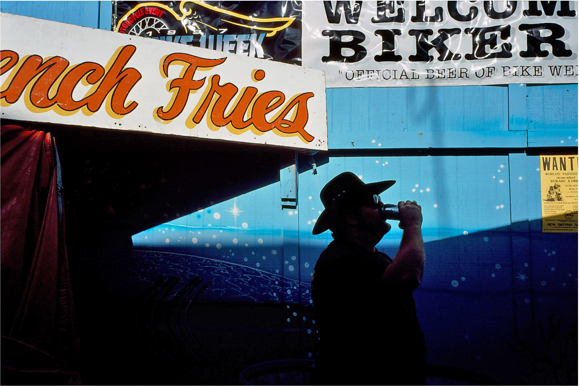
Constantine Manos Florida, USA. 1997. Image © Constantine Manos/Magnum Photos.