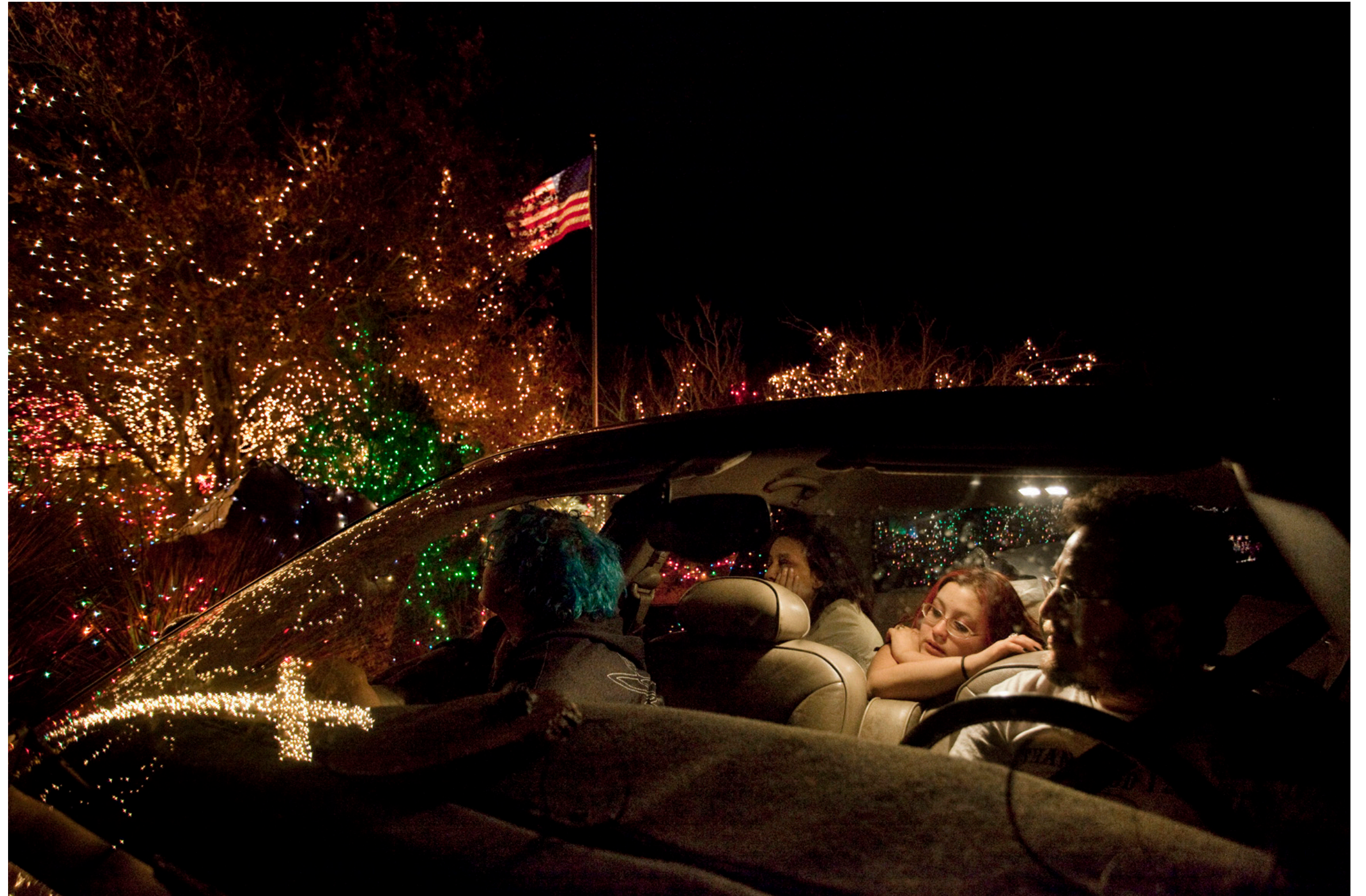
Bieke Depoorter Untitled. USA. 2010. From the series "I Am About to Call it a Day".