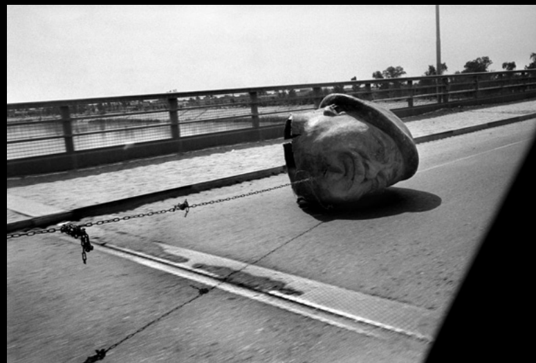
Abbas A bronze head of President Saddam Hussein is paraded in the streets after US troops occupied the capital. Baghdad. Iraq. 2003. Image © A. Abbas/Magnum Photos.