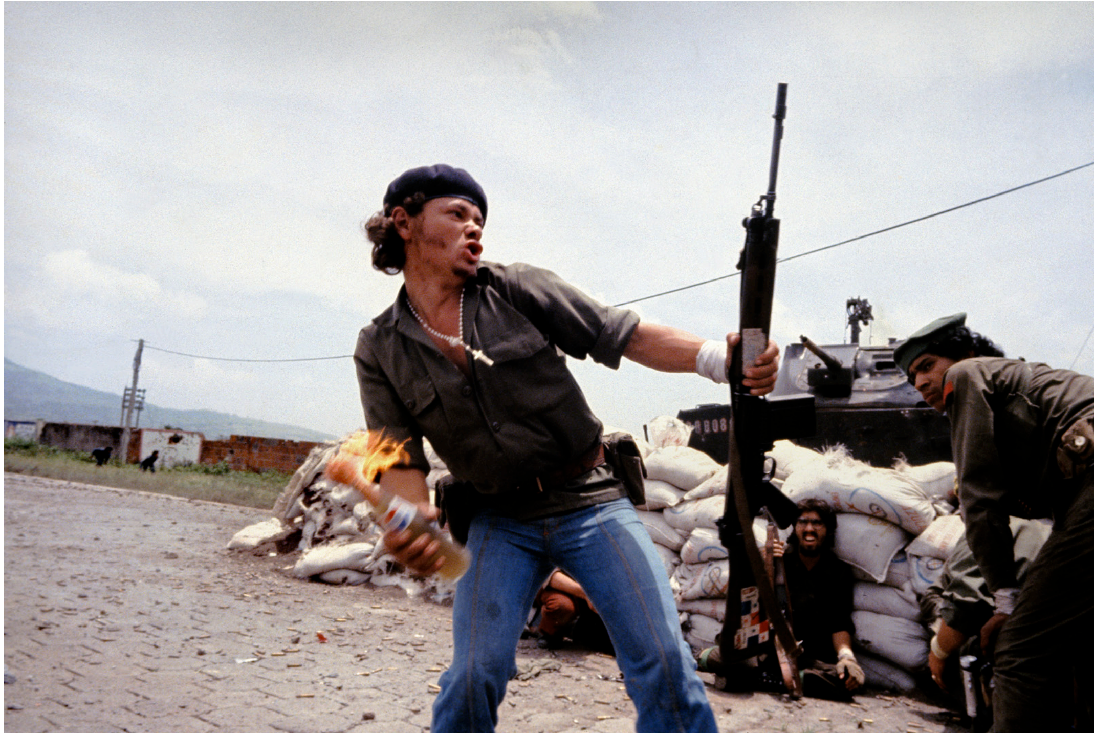
Susan Meiselas Sandinistas at the walls of the Esteli National Guard headquarters. Esteli, Nicaragua. 1979.

“Dig in, follow your instincts and trust your curiosity.”