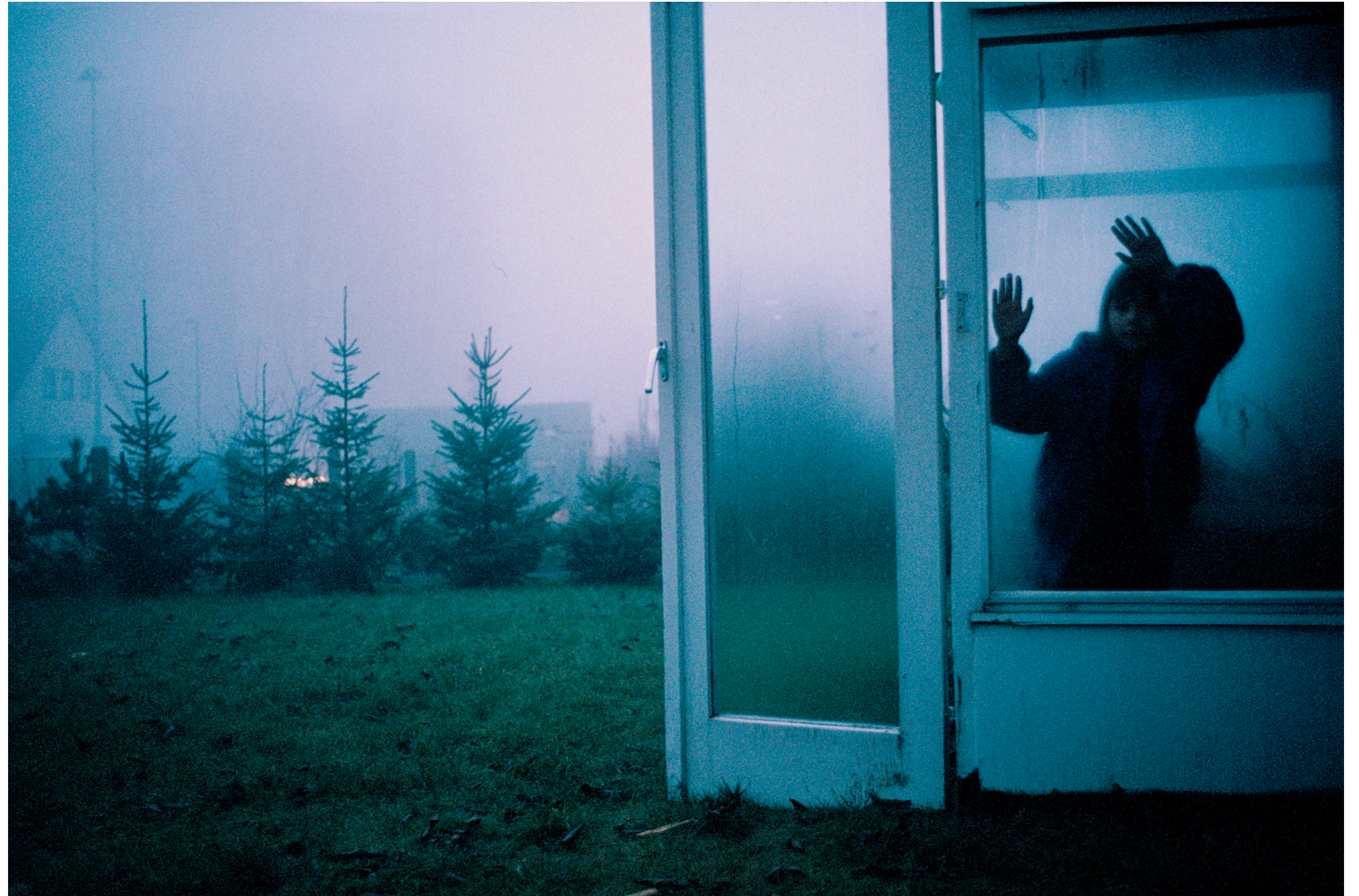
Berlin Wall. Hanover. Germany. 1989.